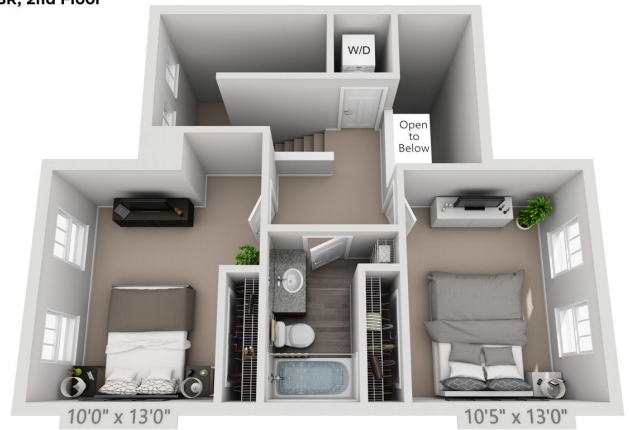
Renderings are an artist's conception and are intended only as a general reference. Features, materials, finishes and layout of subject unit may be different than shown. 3DPlans.com