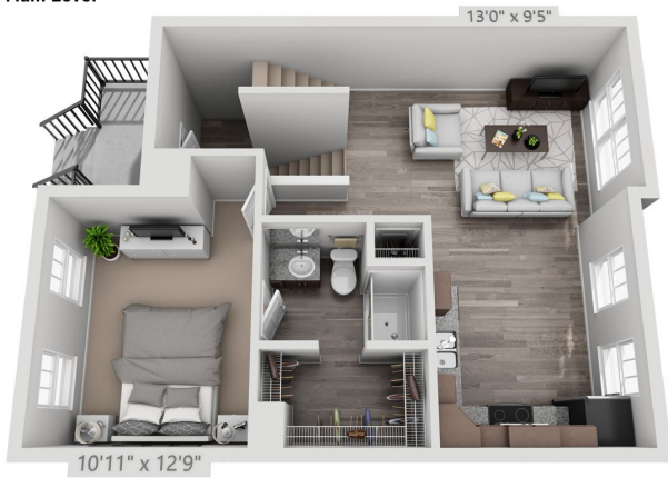
Renderings are an artist's conception and are intended only as a general reference. Features, materials, finishes and layout of subject unit may be different than shown. 3DPlans.com