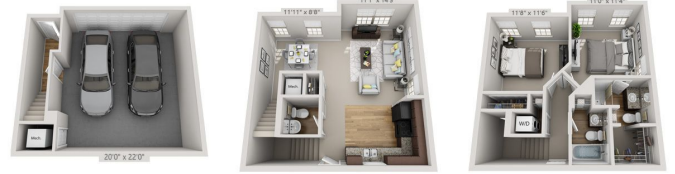
Renderings are an artist's conception and are intended only as a general reference. Features, materials, finishes and layout of subject unit may be different than shown. 3DPlans.com