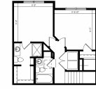
4 UPPER LEVEL PLAN